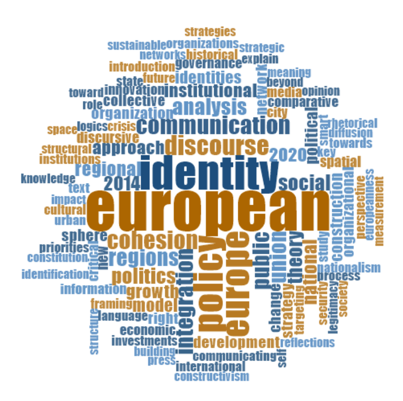
Figure 1 – Word cloud created from social construction literature on European integration

Following previous overviews of academic literature on European integration from social constructivist (i.e. Christiansen, Jorgensen, and Wiener, 1999; Risse, 2009) and discourse (Waever, 2009) perspectives, we distinguish three main areas of application for scholarly inquiry. These three areas focus on a) laws, rules, and norms in EU governance; b) polity and governance ideas, public debate on the EU and its policy; and finally c) social identity and citizens' identification with the EU. Risse motivates the use of this partition as follows (2009: 151): First and with reference to normative systems, "the mutual constitutiveness of agency and structure allows for a deeper understanding of Europeanization including its impact on statehood in Europe". Second and referring to public debates, the focus on communicative practices allows investigation of "how Europe and the EU are constructed discursively" and how a European public sphere emerges. Finally and with reference to identity, "the constitutive effect[s] of European law, rules, and policies enables us to study how European integration shapes social identities and interests of actors". For each of these three areas of scholarly contribution, we will highlight the academic background (i.e. International Relations, Comparative Politics, Organization Theory, Sociology, etc.) as well as core insights and contributions to explain European integration and identity.